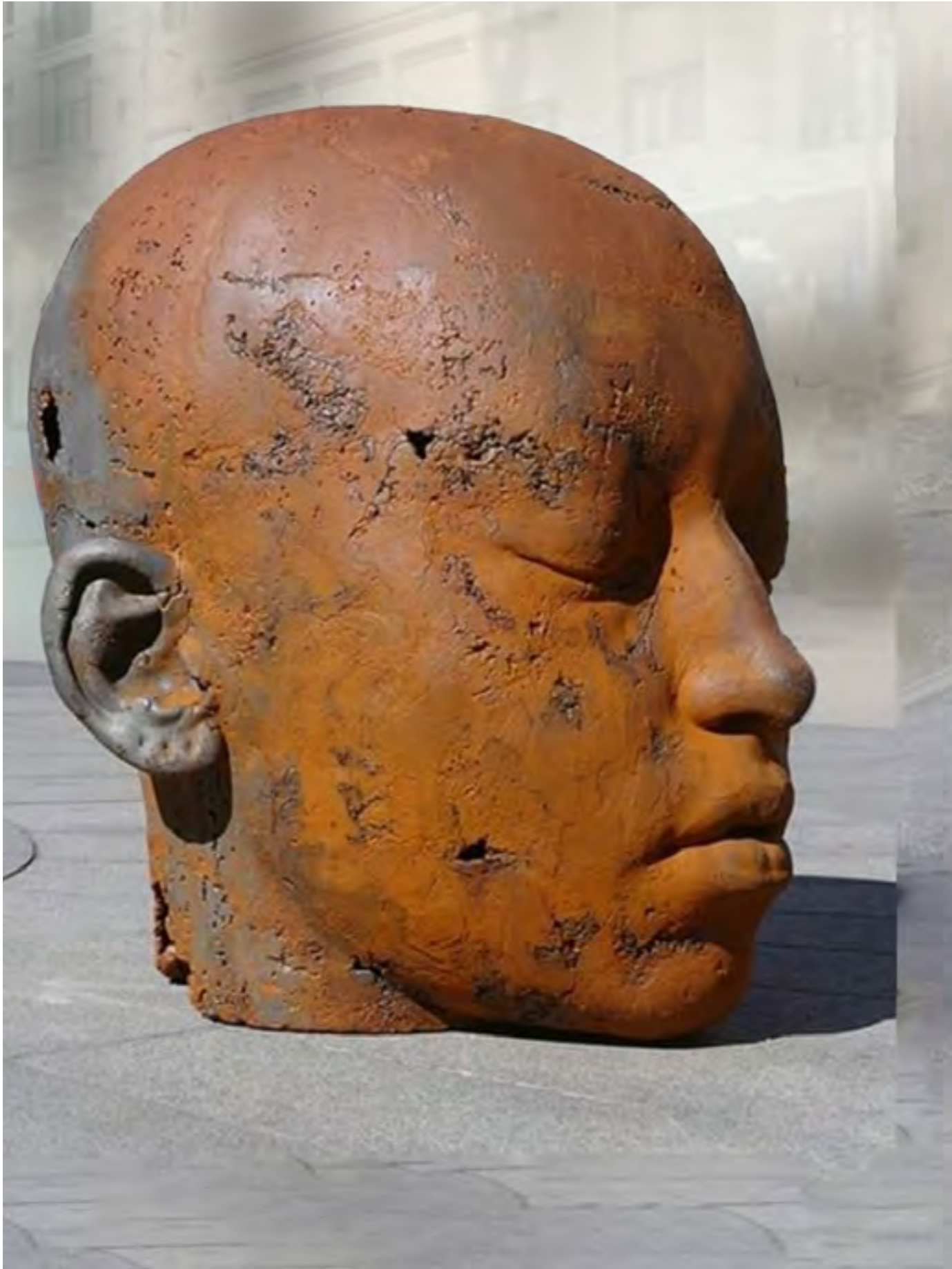
«ABOUT MEMORIES VI», 2024 Cast Iron 27,5x29,5x47 inches / 70x75x120 cm.