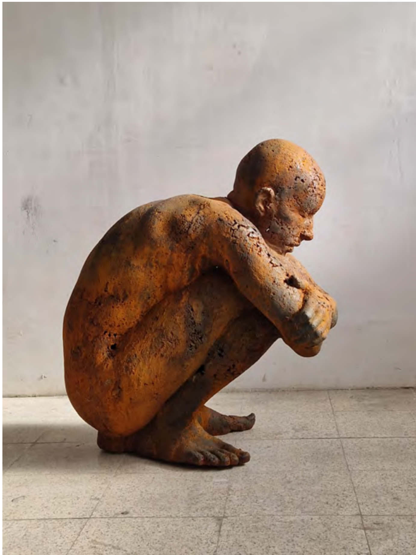
«HEAVYWEIGHT», 2024 Cast Iron 43x24x35,5 inches / 110x60x90 cm.