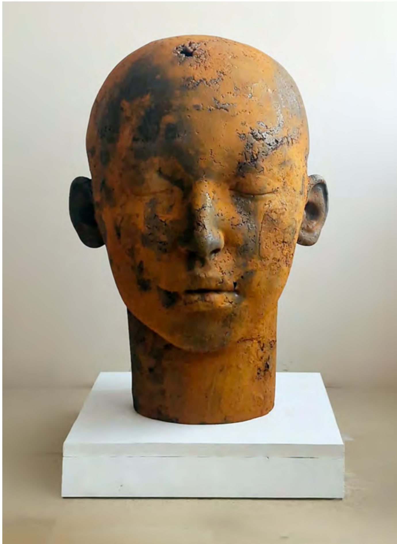
«METAL ON METAL III» 2024 Cast Iron 39,3x31,5x31,5in | 100 × 80 × 80 cm