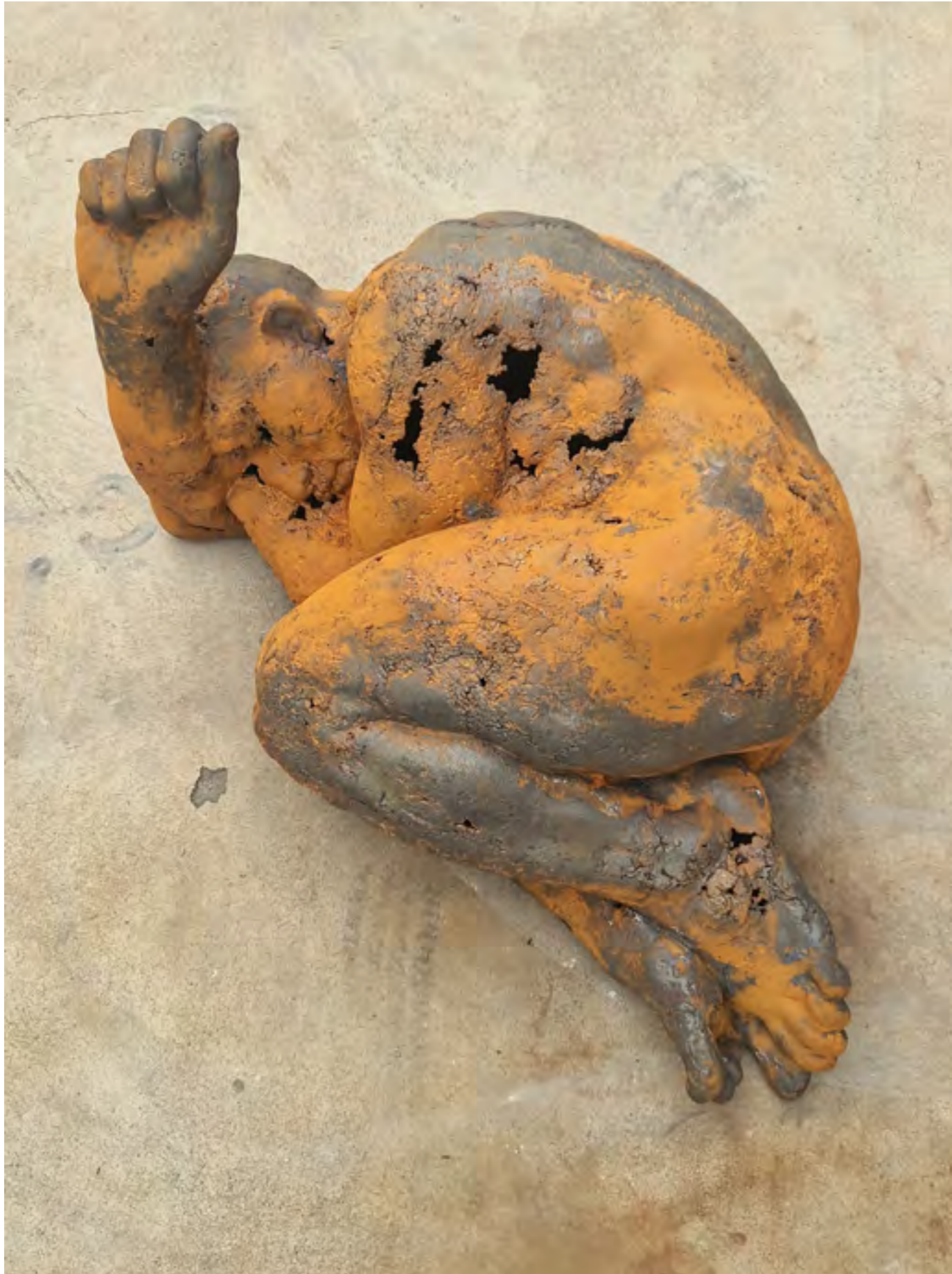
«POPULATION GEOGRAPHY II», 2024 Cast Iron 35,5x59x39 inches / 80x150x100 cm.