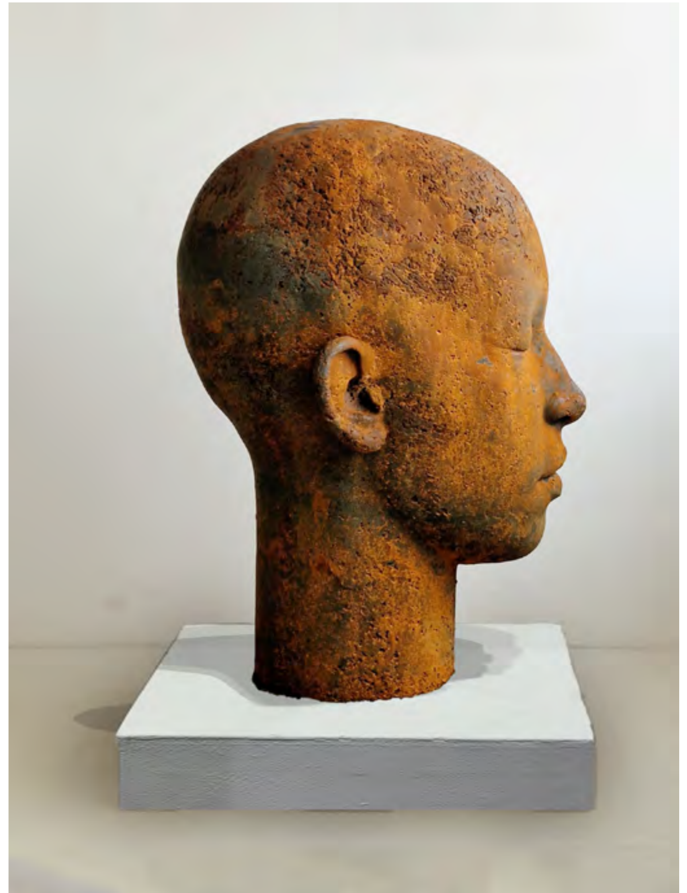
«ISLANDS», 2024 Cast Iron 41x31,5x31,5 inches / 105x80x80 cm