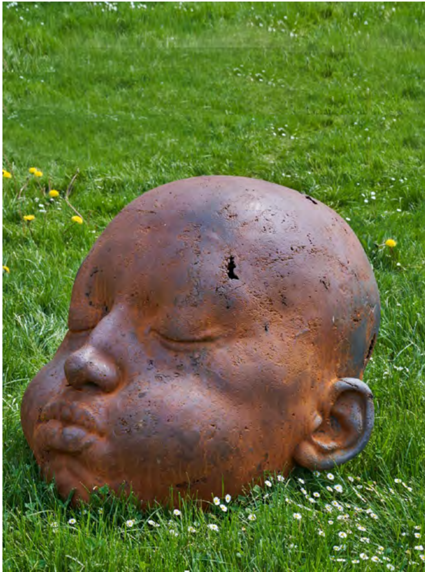
«ABOUT MEMORIES VIII», 2024 Cast Iron 33,5x35x45 inches / 85x90x115 cm.