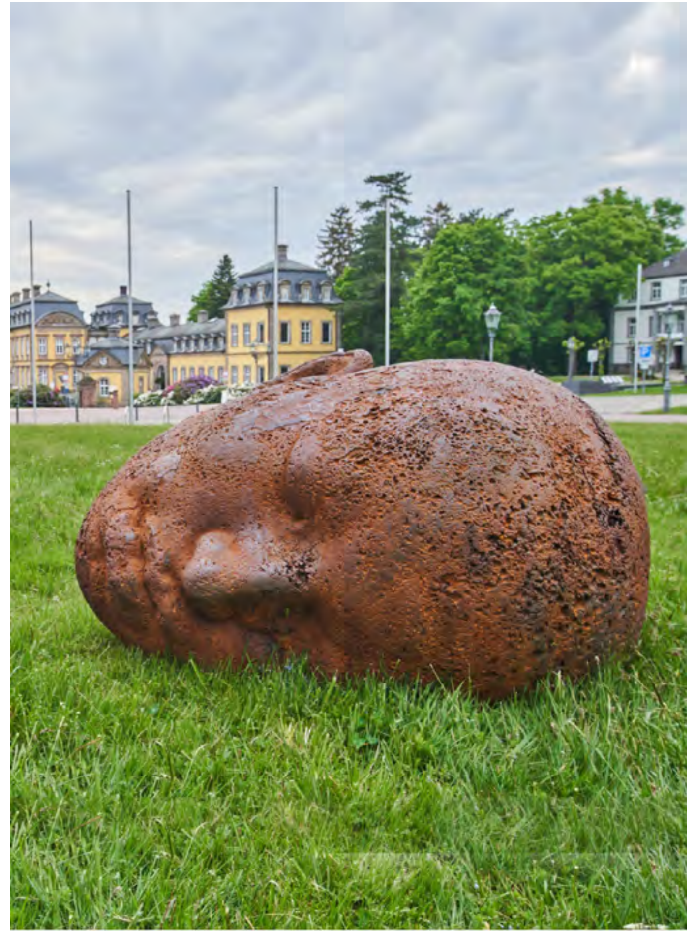
«ABOUT MEMORIES VII», 2024 Cast Iron 41x43x39 inches / 105x110x100 cm.